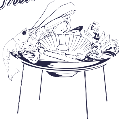
HOUSE PLATTER OF VARIOUS WARM SHELL FISH